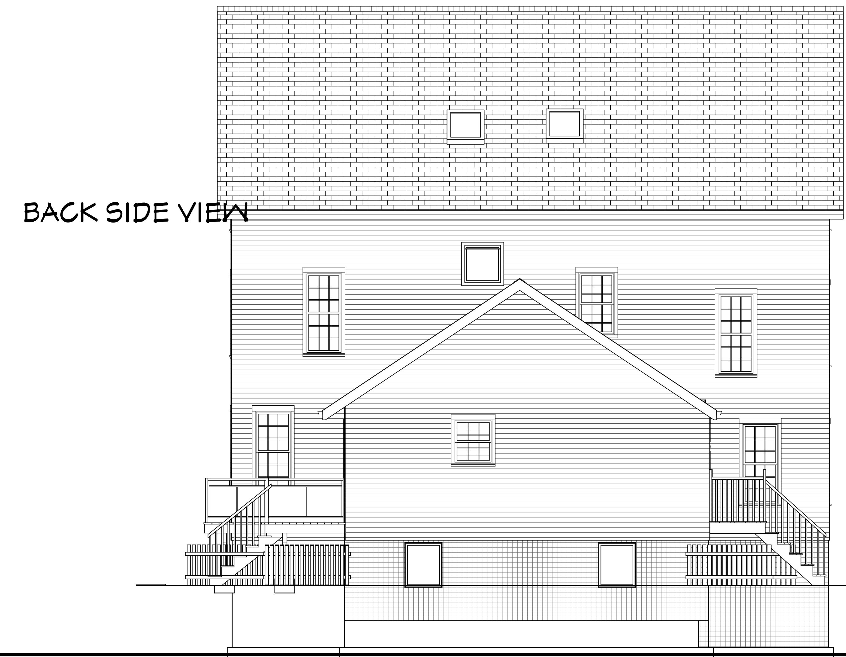
BACK SIDE VIEW