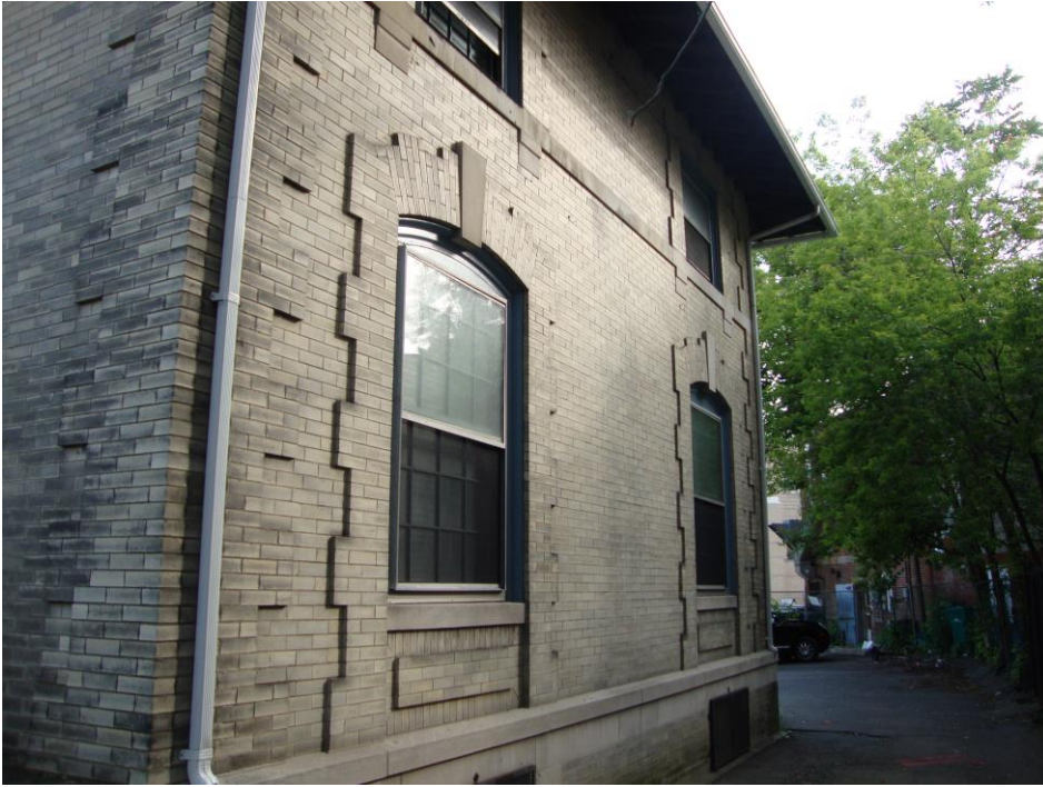
Right (north) elevation photographed 6/2/2019.