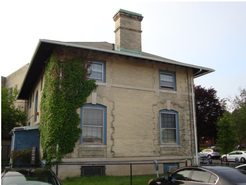
Left (south) elevation photographed 6/2/2019.