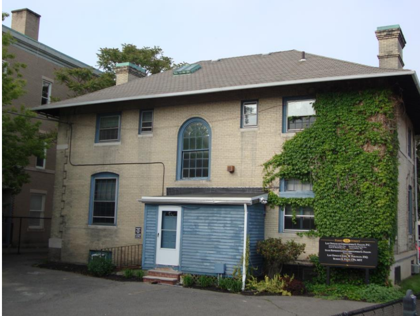
Rear (west) elevation photographed 6/2/2019.